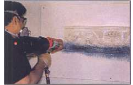
Spray urethane or silicone rubber for making molds of any original model.