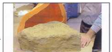
Spray rigid foam that is flame rated for making fast lightweight castings (see foam rock above) or special effects.