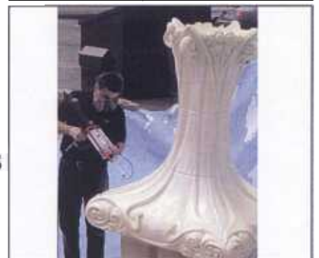
Spray urethane plastic to coat styrofoam for themeing & special effects.